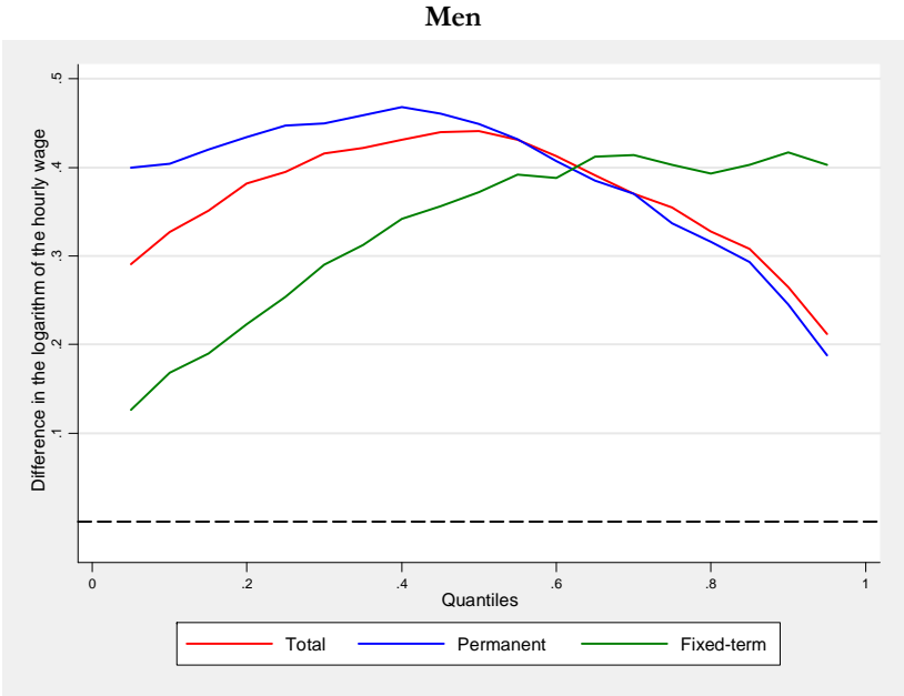
Figure 1. Public-private sector wage differentials across the wage distribution.